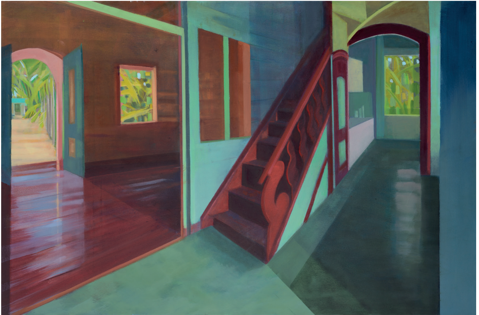
Plantation House (Suriname) | oil on canvas | 84 x 126cm