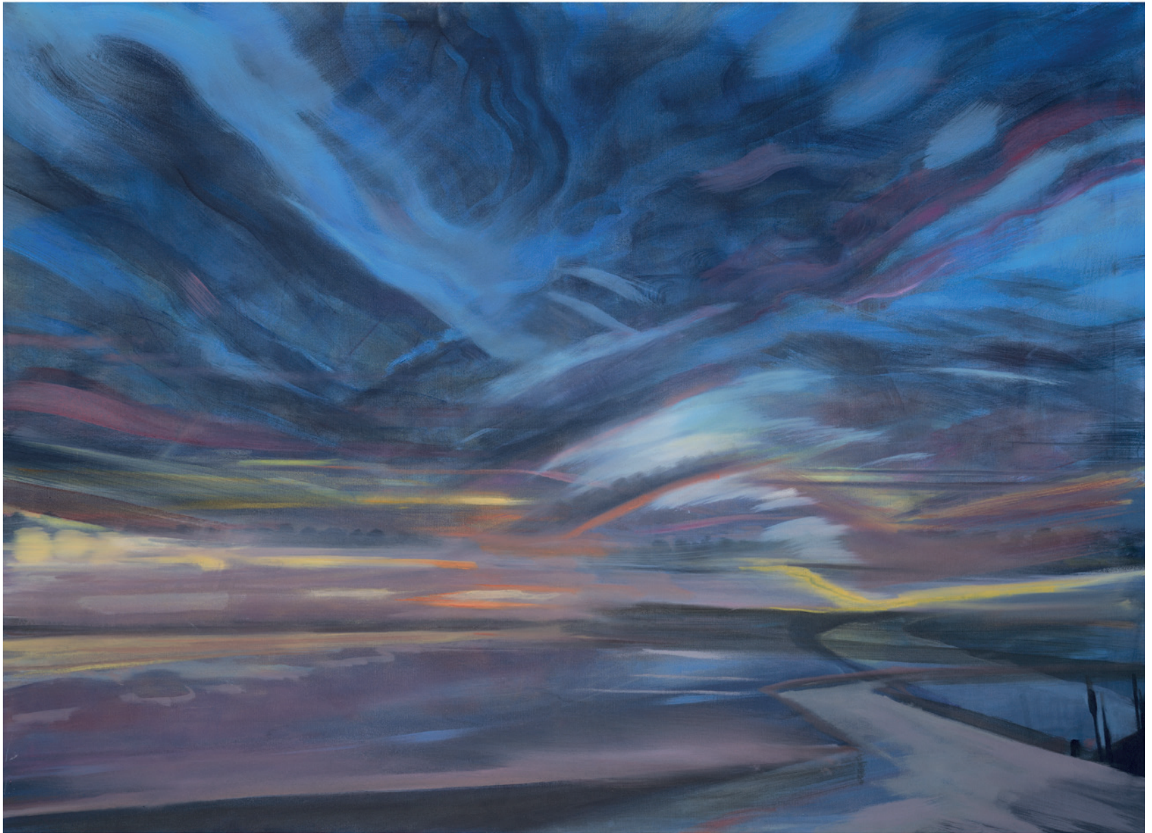
Blyth Estuary | oil on canvas | 108 x 148cm