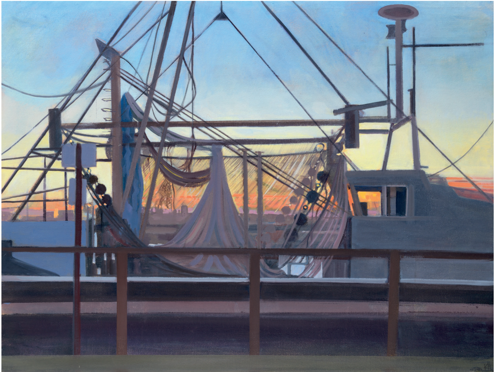
Harbour, Dusk (Southwold) | oil on canvas | 60 x 79cm