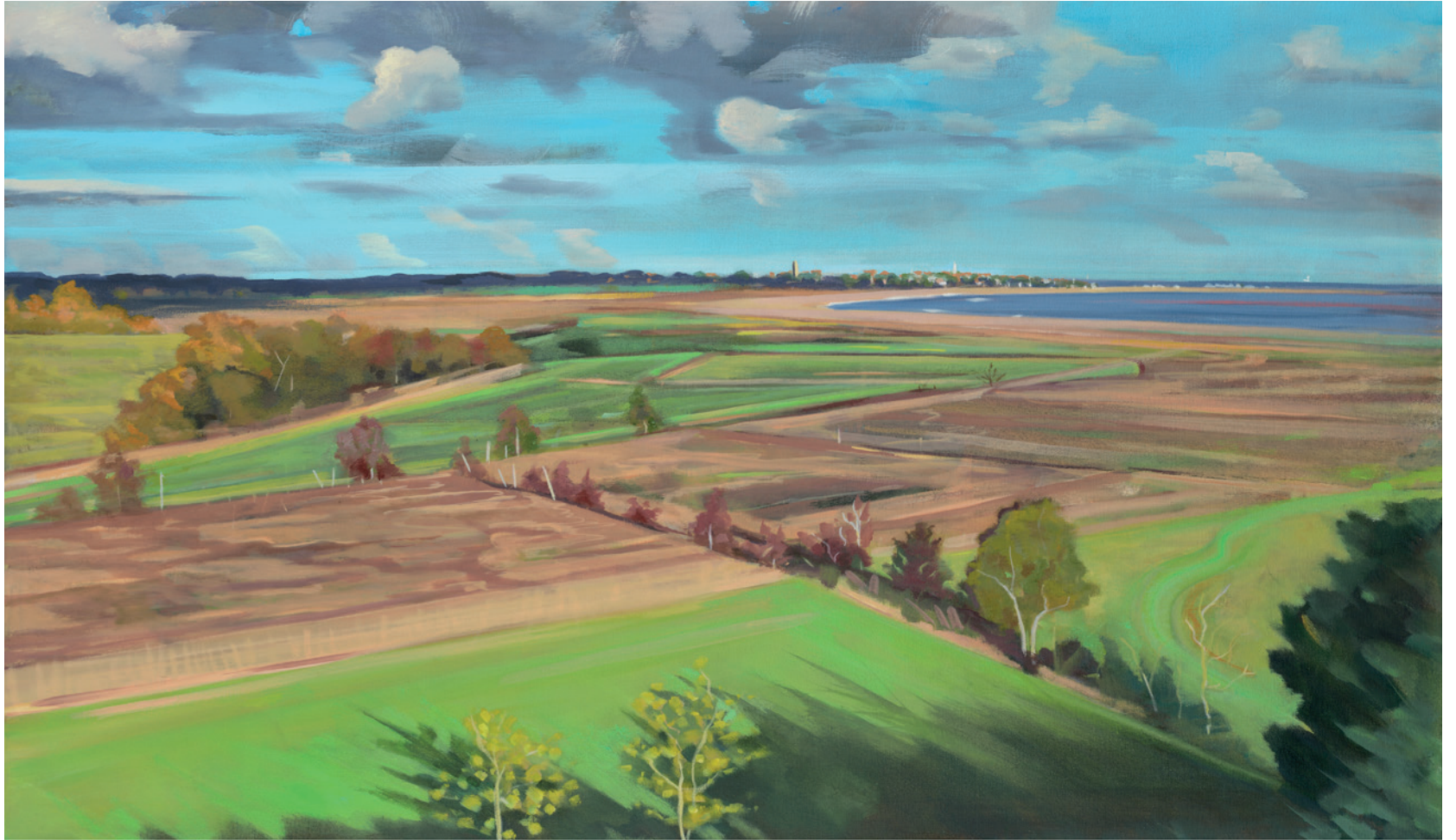
Dingle Marsh, Dunwich | oil on canvas | 70 x 117cm