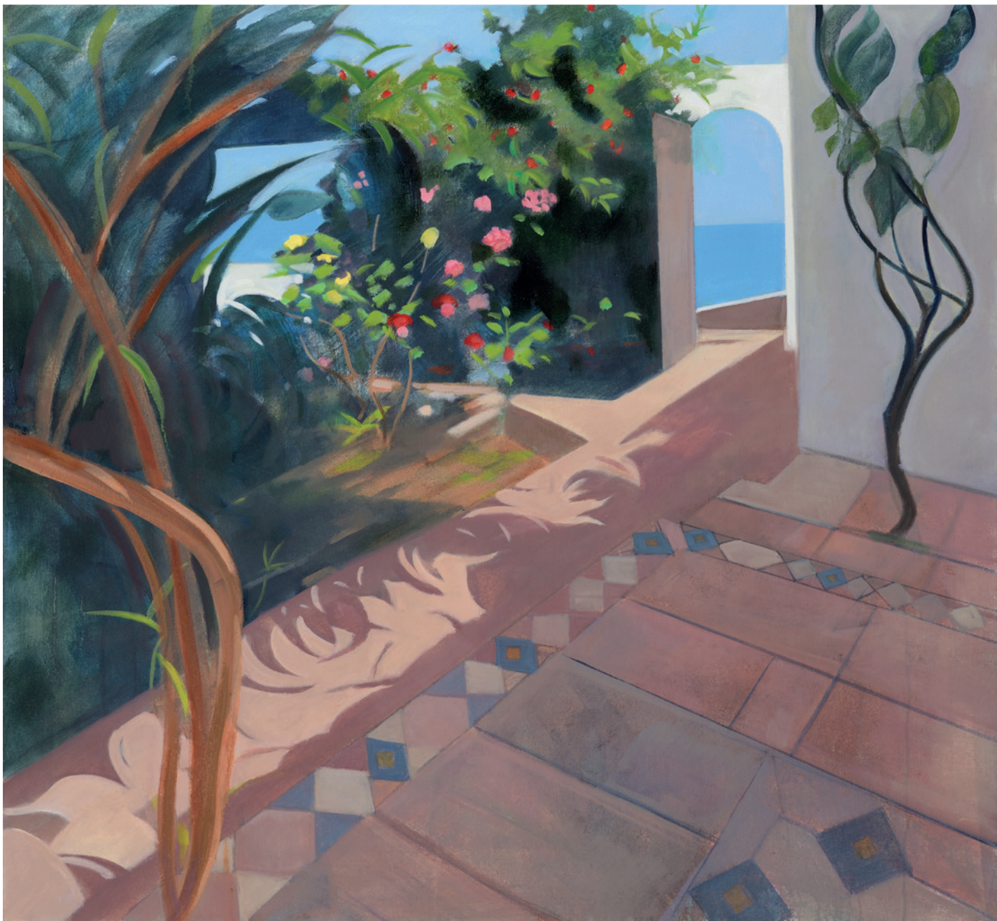
Terrace with Roses | oil on canvas | 84 x 91cm