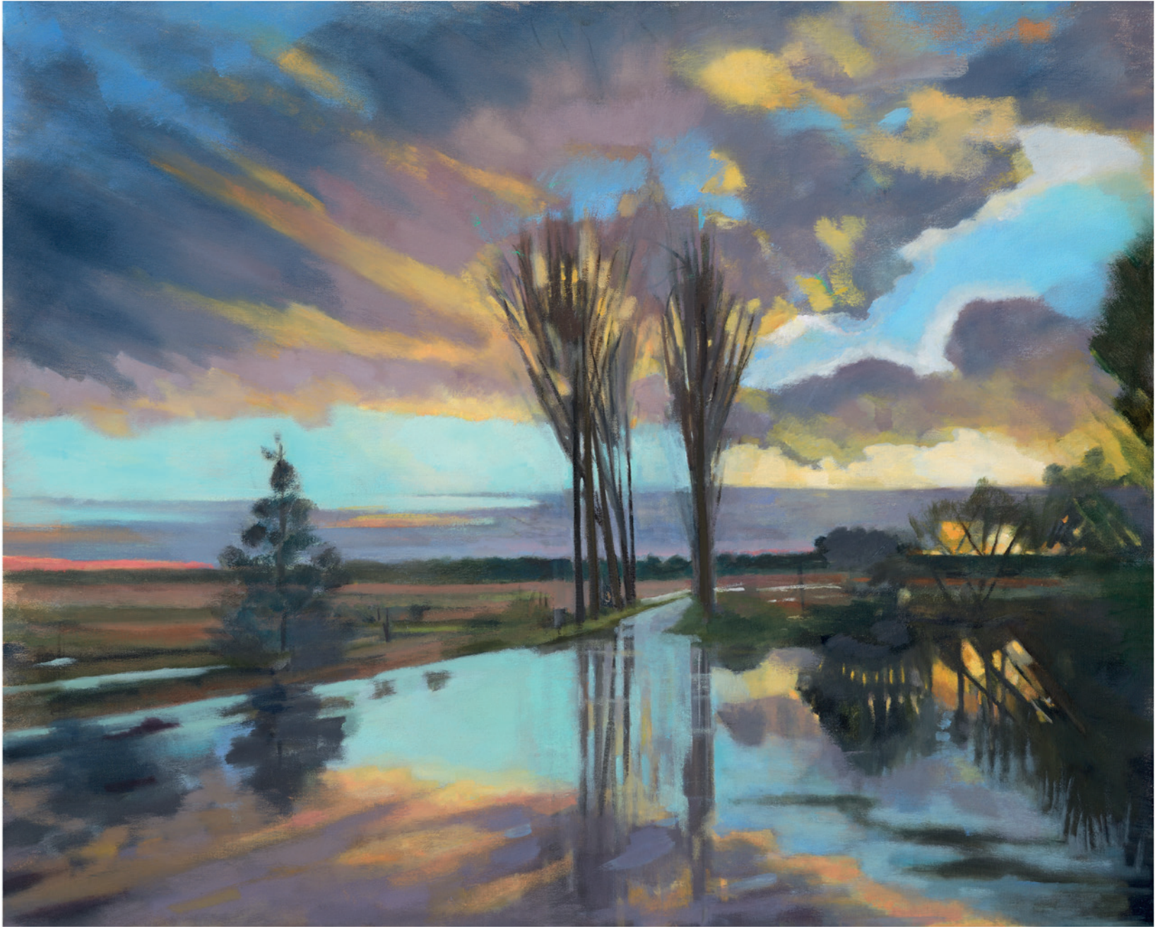
Winter Marsh, Suffolk | oil on canvas | 80 x 106cm