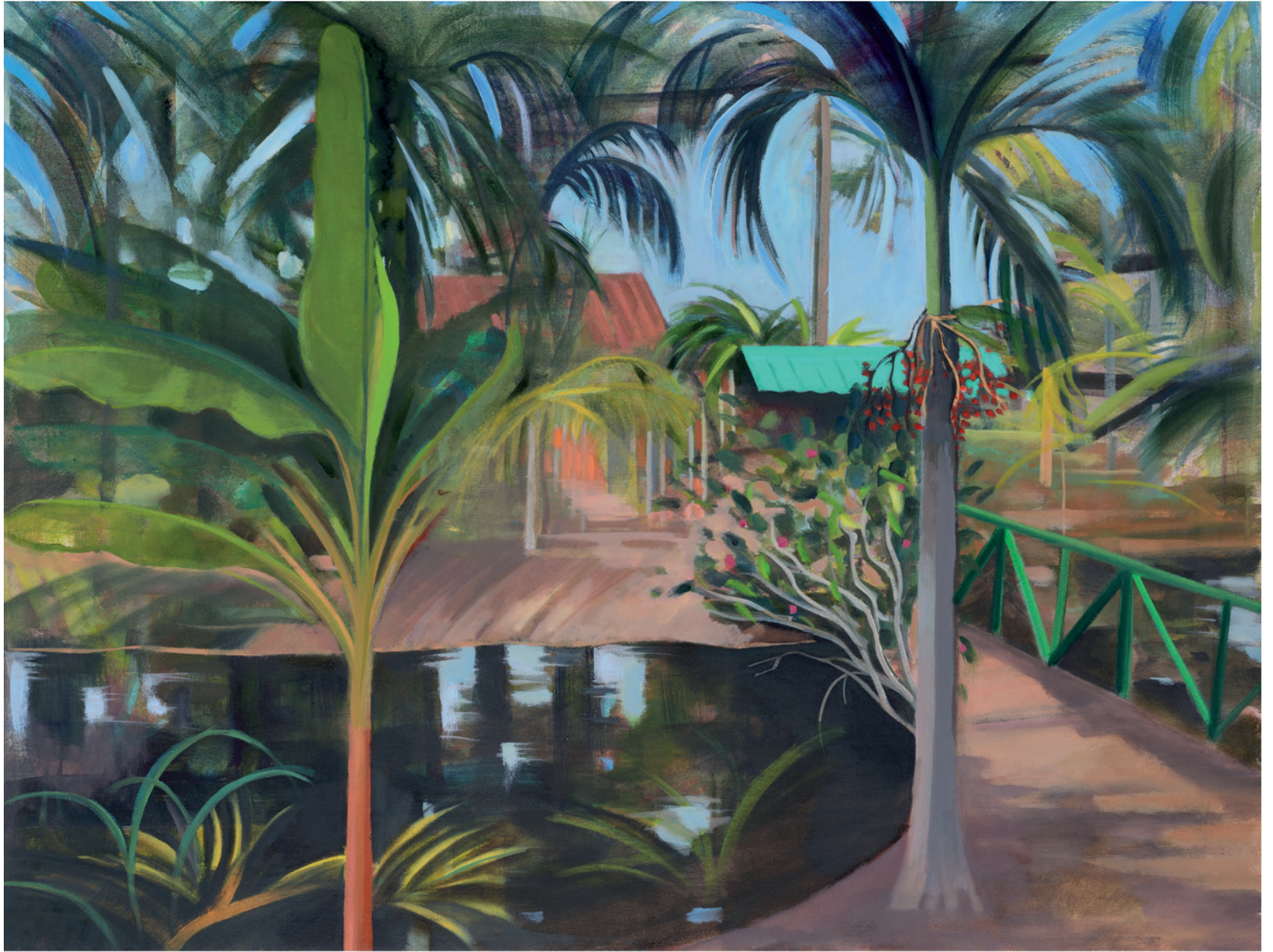
Garden (Suriname) | oil on canvas | 78 x 102cm