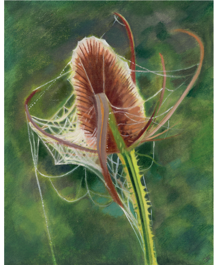
Cobweb and Teasel | oil on canvas | 47 x 37cm