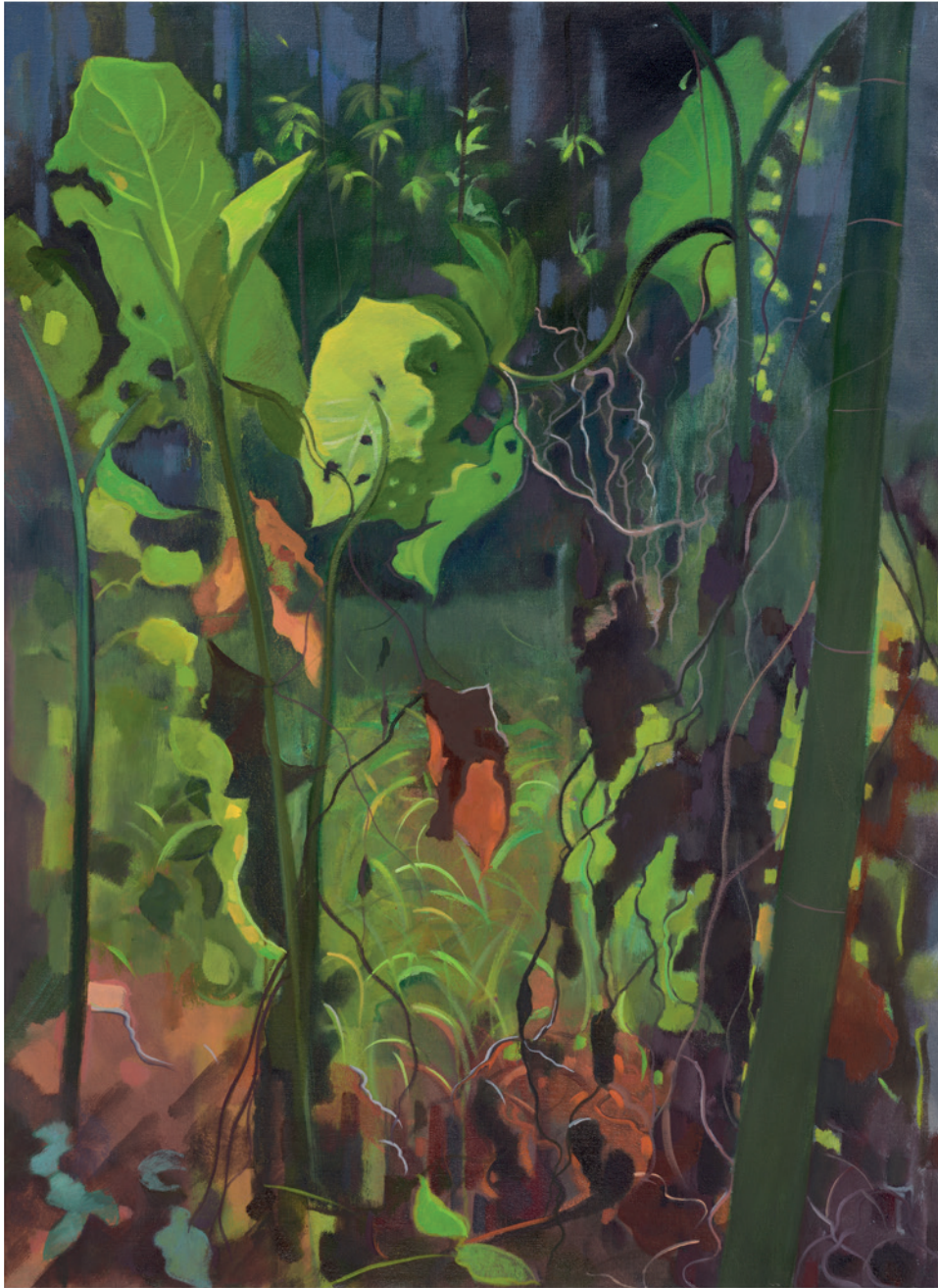
Forest Edge (Suriname) | oil on canvas | 87 x 65cm