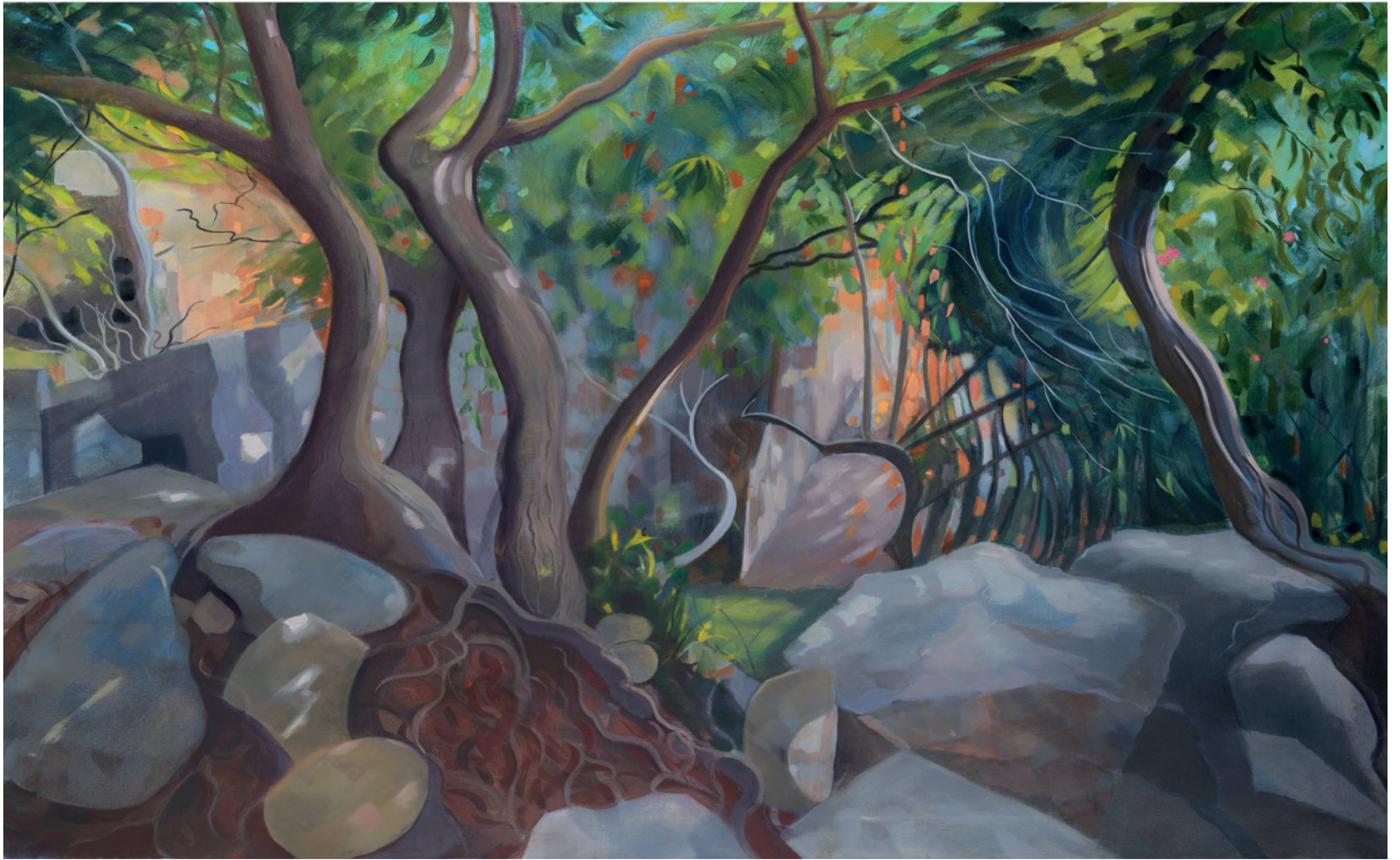
Wooded Hollow (Ikaria) | oil on canvas | 92 x 150cm