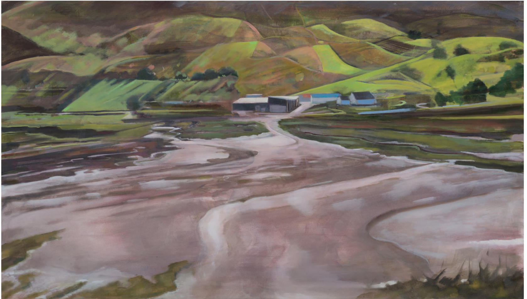
Low Tide, Glen Valley (Donegal) | oil on canvas | 95 x 166cm