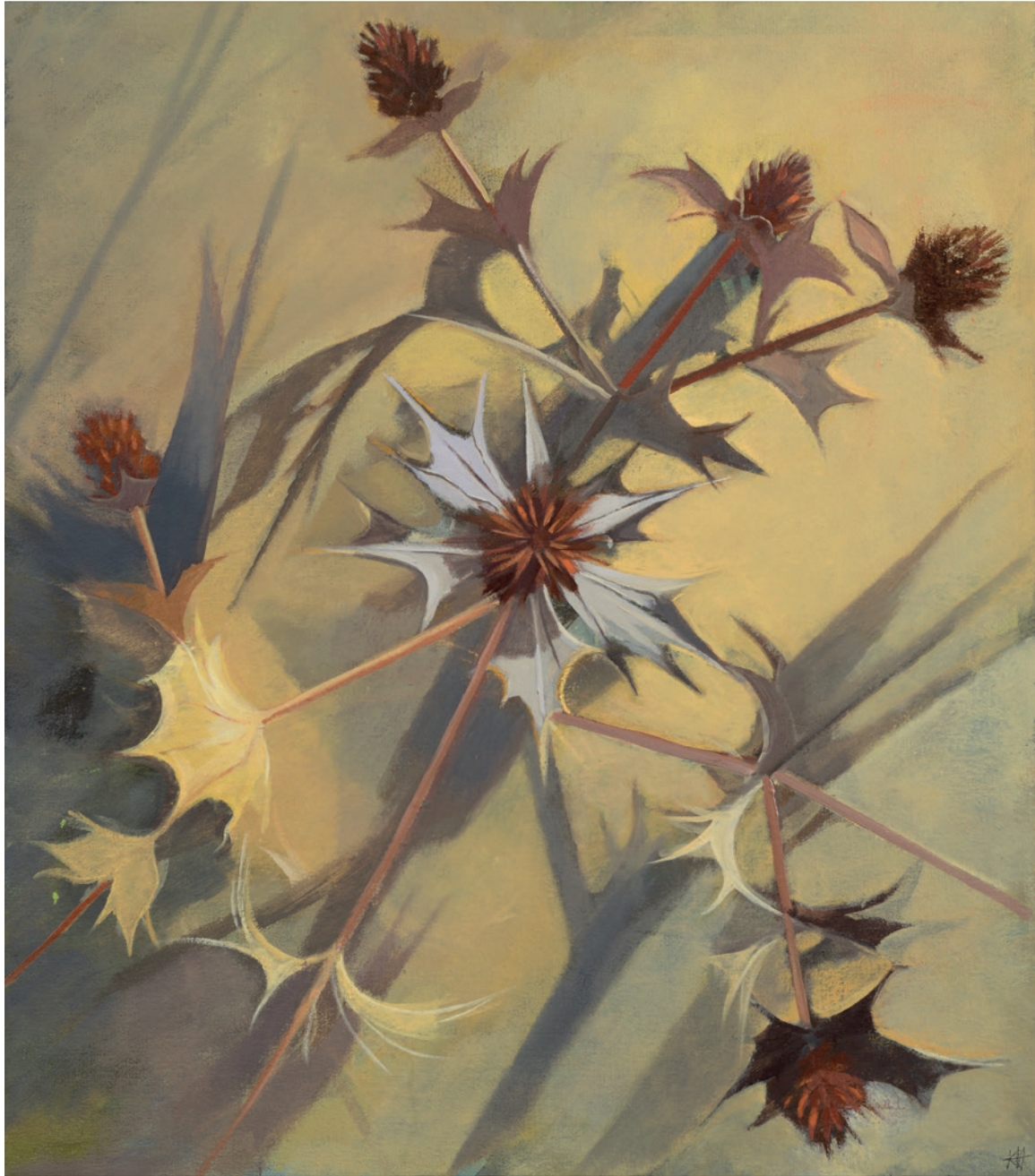
Winter Sea Holly | oil on canvas | 57 x 50cm