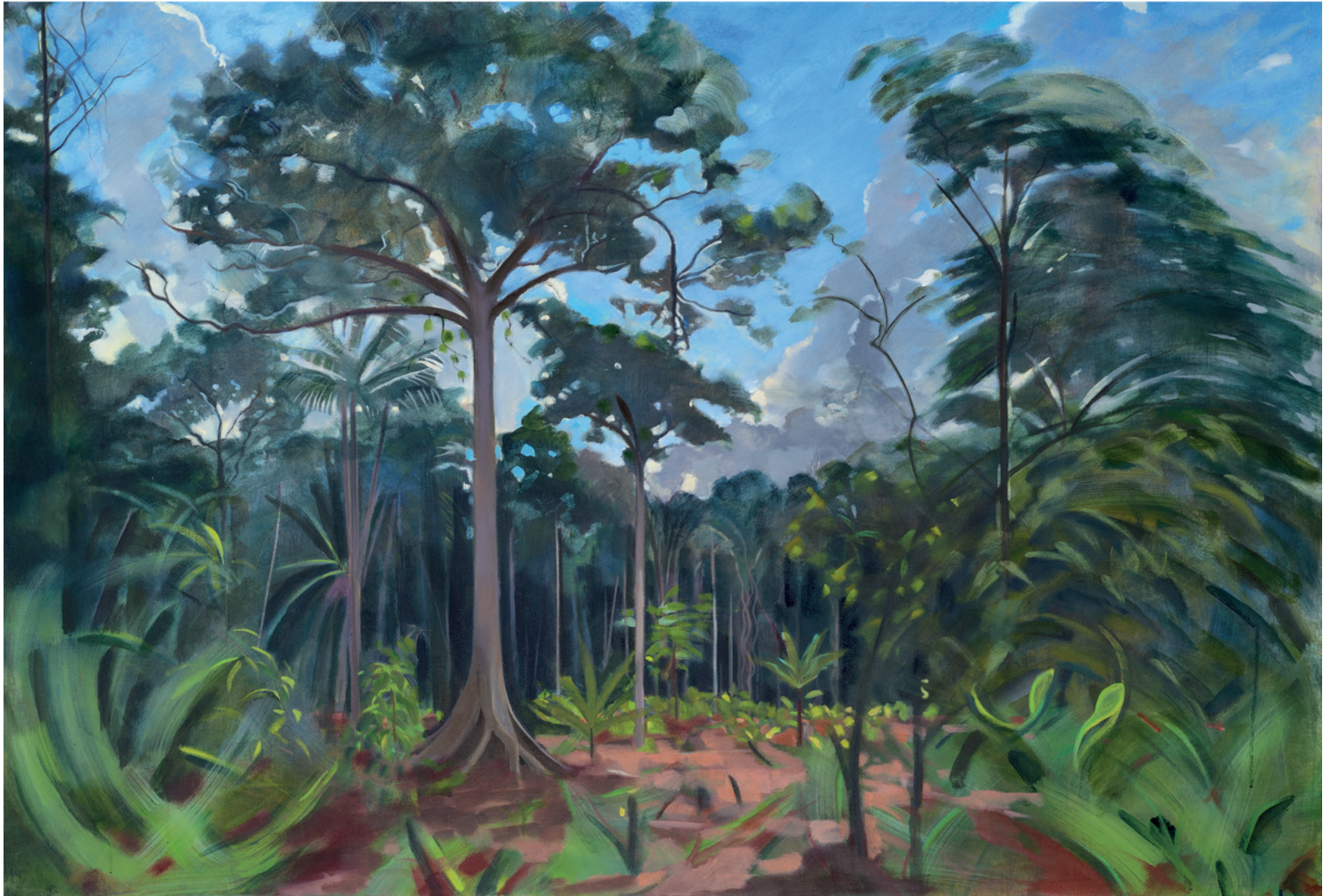
Clearing with Kapok Tree (Suriname) | oil on canvas | 89 x 132cm