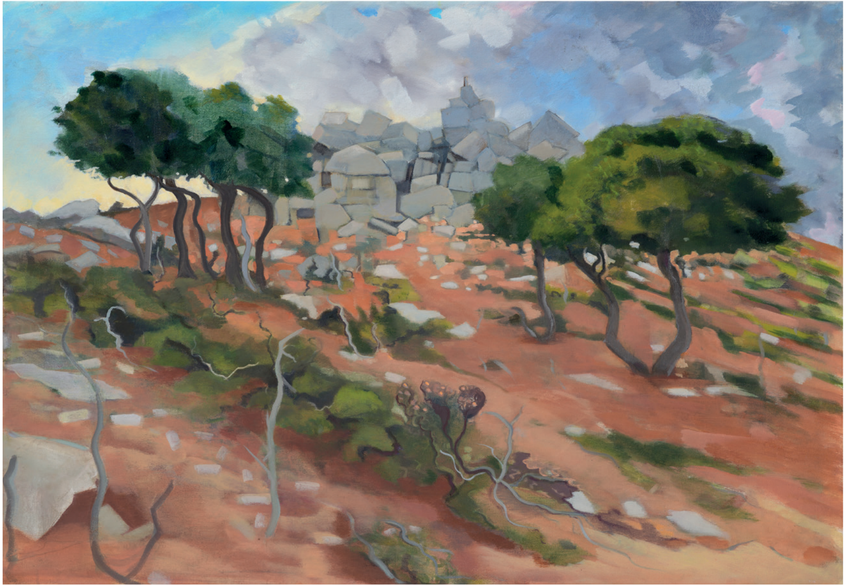
Atheras Landscape (Greece) | oil on canvas | 74 x 107cm