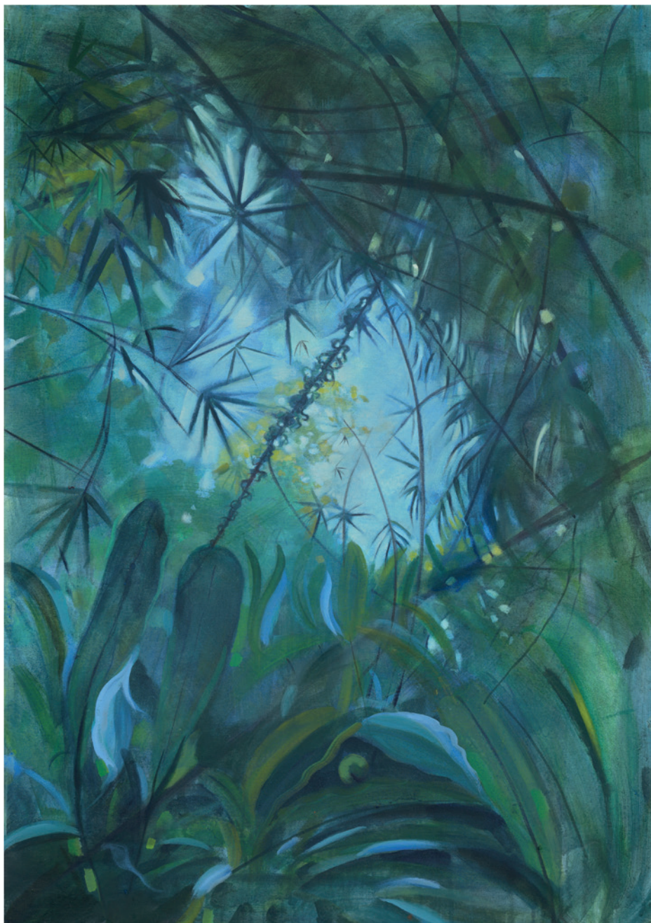
Canopy (Suriname) | oil on canvas | 102 x 73cm

Waking before dawn on the banks of the Saramacca River a strange unfamiliar sound echoes from the surrounding forests, like thunder it triggers a sense of trepidation, the sound moves, growing closer and then recedes into the distance which both confuses and unsettles the listener. It is the call of the Howler Monkeys hidden and mysterious within this vast area of impenetrable forest. A place without humans, a refuge for the natural world.