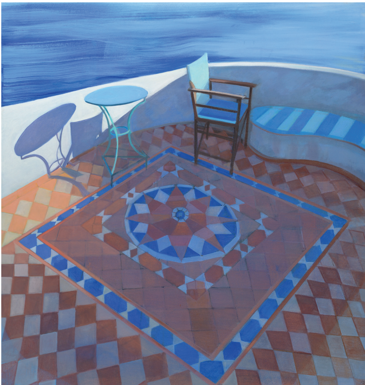
Sun Trap (Northern Aegean) | oil on canvas | 96 x 92cm