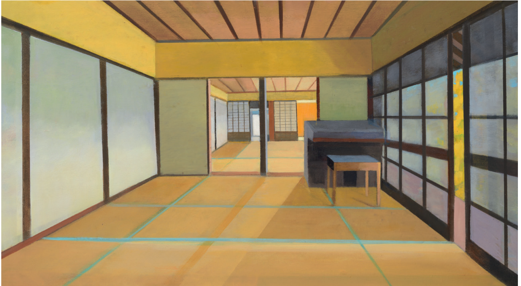
Mountain House (Uchiko, Japan) | oil on canvas | 66 x 117cm