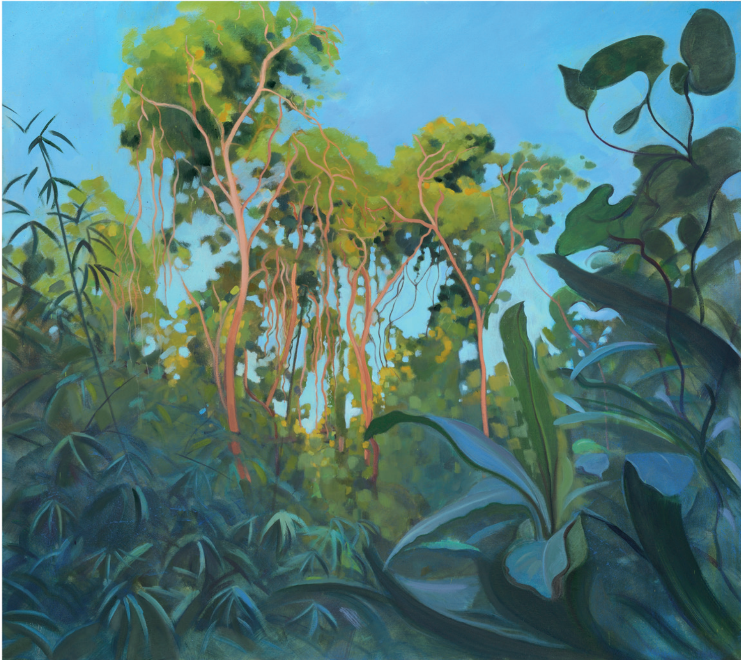
Rising Forest (Suriname) | oil on canvas | 97 x 109cm