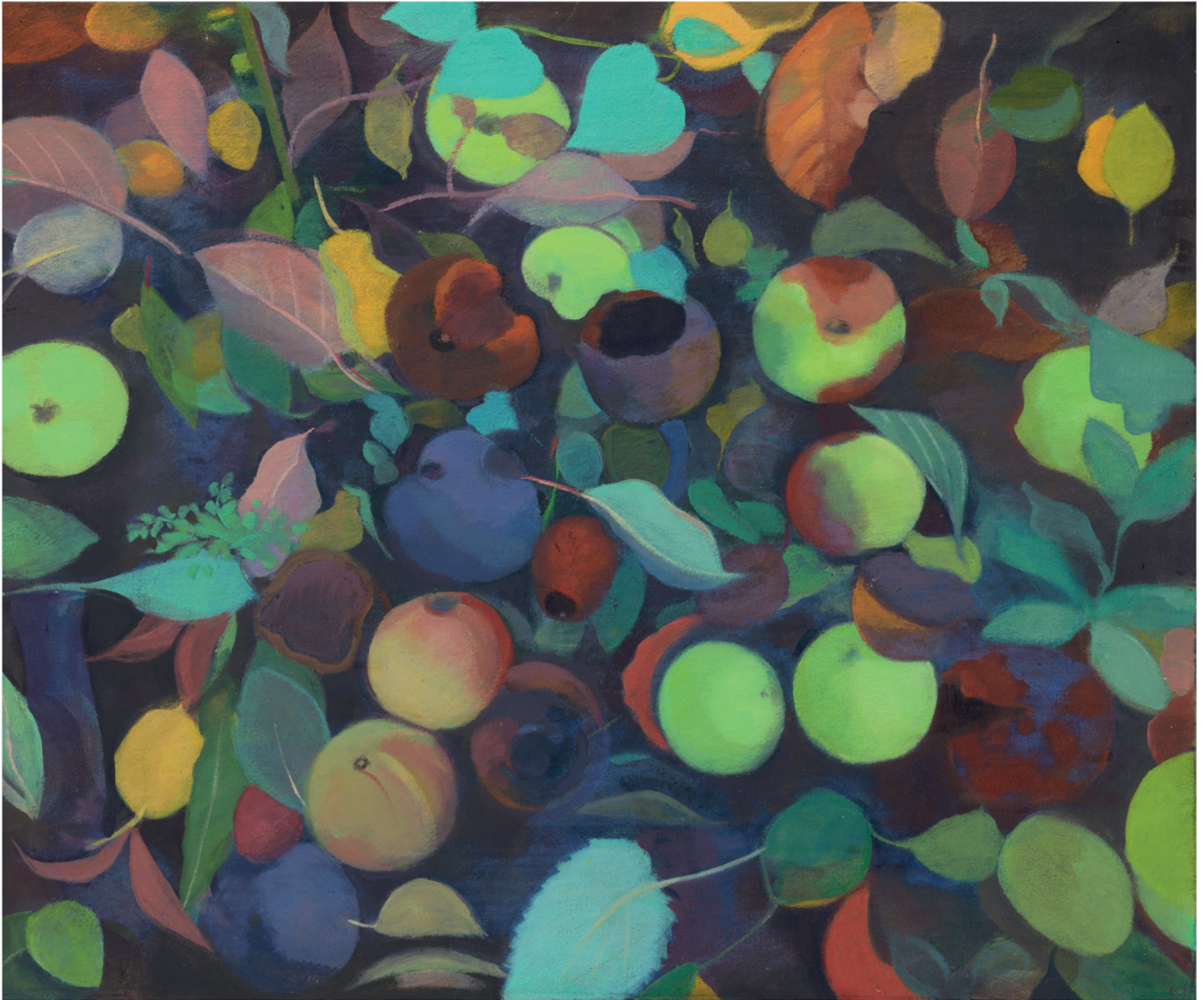
Autumn Floor | oil on canvas | 61 x 74cm