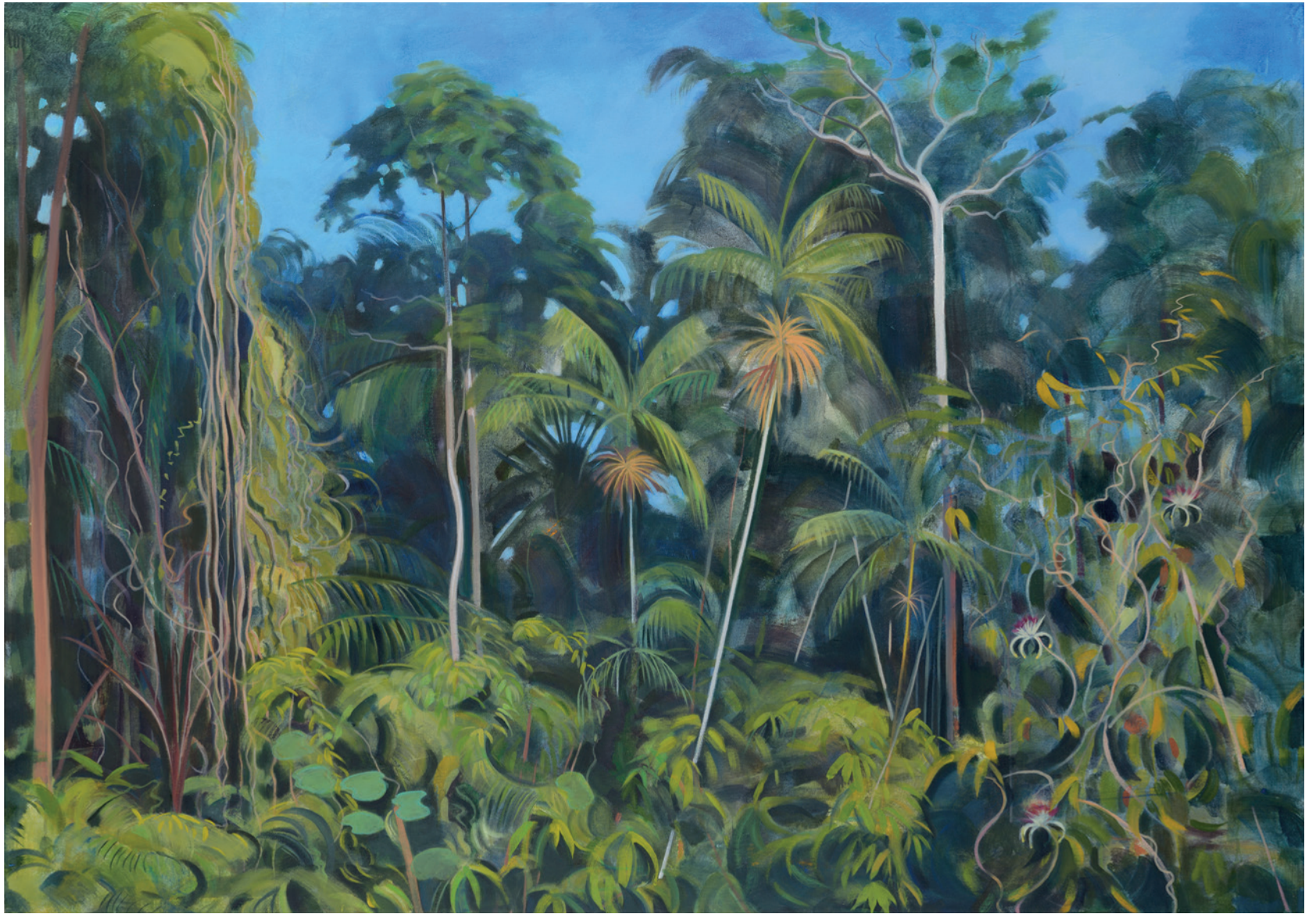
Forest Wall (Suriname) | oil on canvas | 100 x 143cm