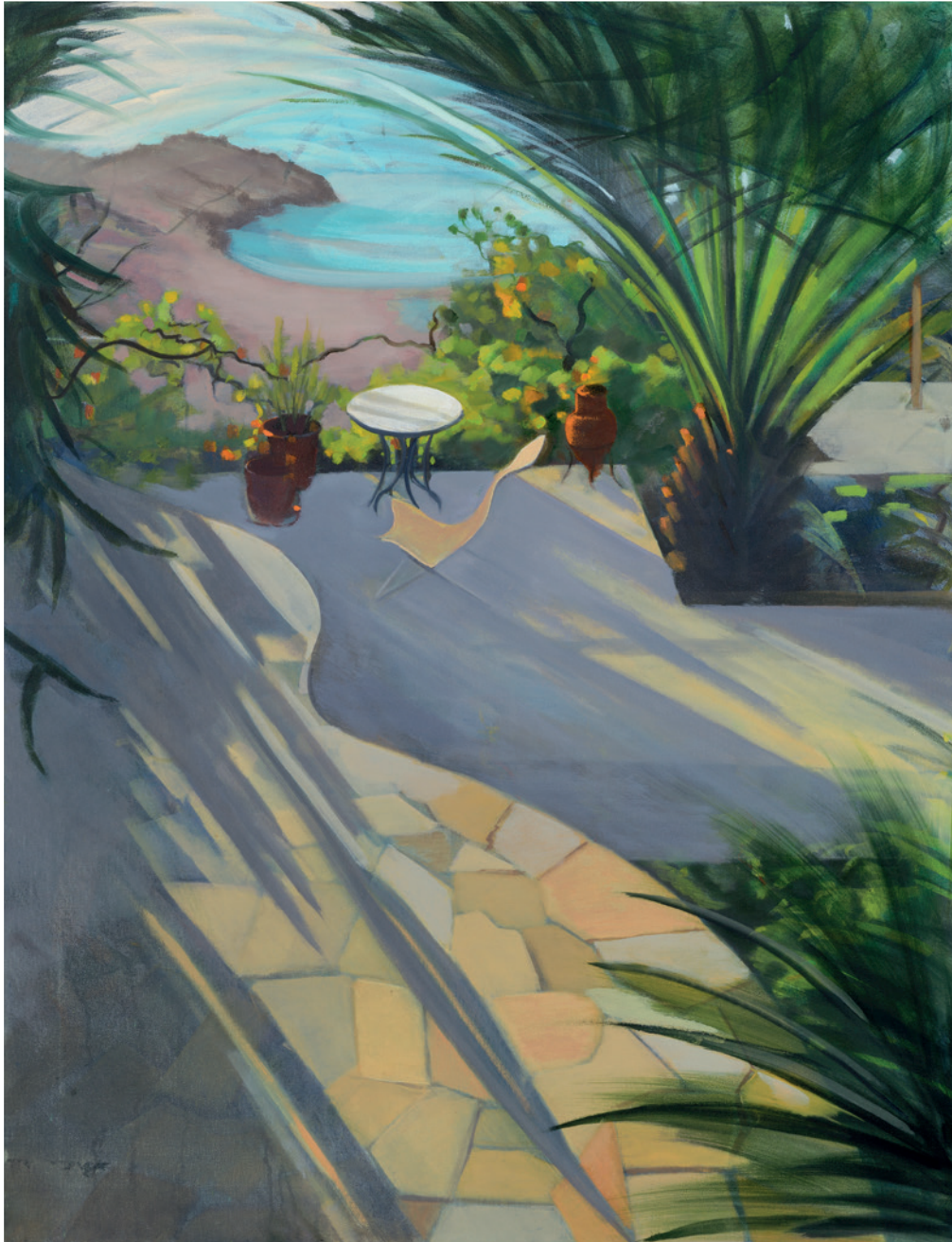
Late Afternoon (Ikaria) | oil on canvas | 100 x 74cm