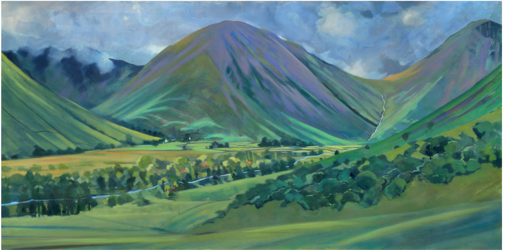
Wasdale (Cumbria) | oil on canvas | 103 x 206cm