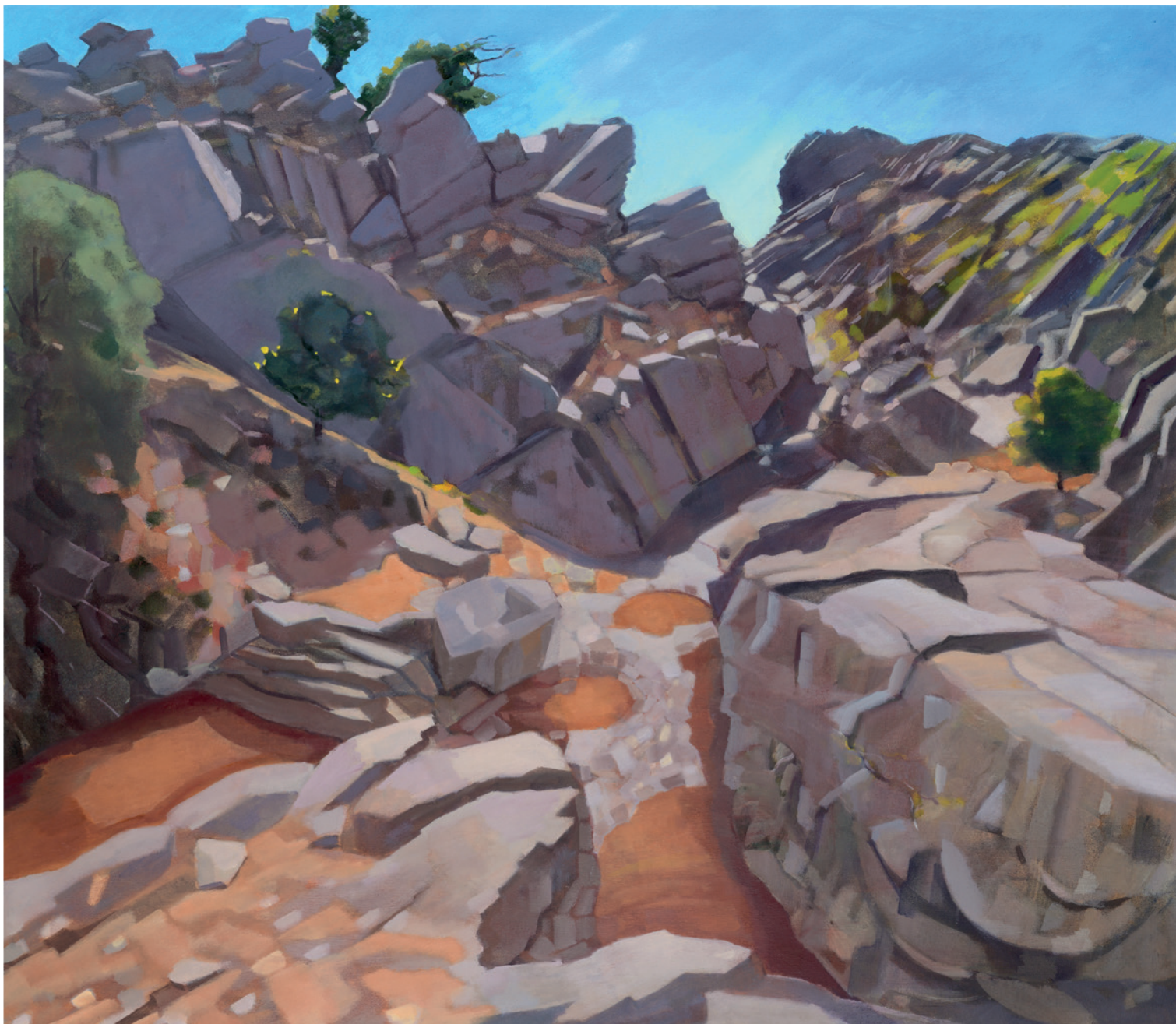
Atheras Ravine | oil on canvas | 100 x 116cm